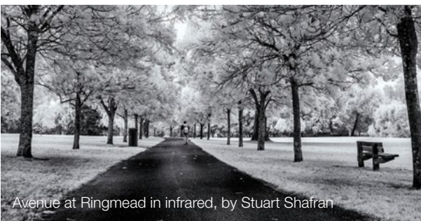
Avenue at Ringmead in infrared, by Stuart Shafran

http://www.bracknell-forest.gov.uk/parksandcountrysidevents