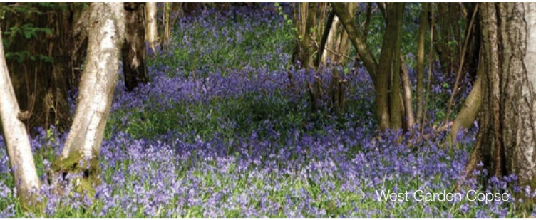
West Garden Coarse