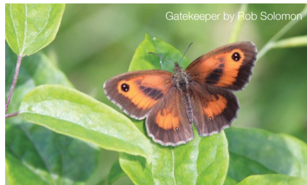
Gatekeeper

Meet: At the giant picnic bench. Parking available at the car park, off Lily Hill Road, Bracknell, RG12 2RX.