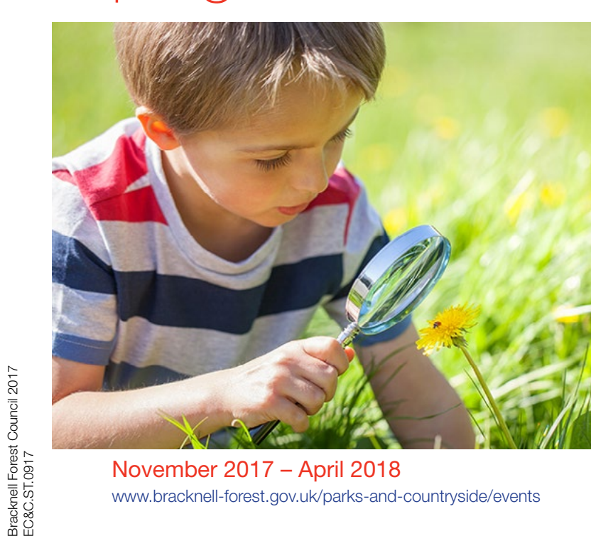
November 2017 - April 2018 www.bracknell-forest.gov.uk/parks-and-countryside/events

All events are free unless otherwise stated.